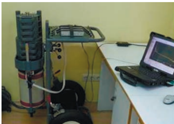
Fig. 3. Gamma radiation spectrometer (CANBERRA, USA)

of the above MDA, its amount should not exceed about 3 \times 10^7 Bq of ^{210}\text{Po} so that in the measured gamma-ray spectrum a peak of 803 keV would not be identified. Since such a peak was not detected, it can be concluded that the available results of physical measurements of the gamma spectra of Arafat's urine samples done in 2004 also exclude the hypothesis of a possible ^{210}\text{Po} activity entry into the body in an amount equal to or exceeding 10^8 Bq.