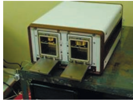
Fig. 2. Ortec Duo Alpha Radiation Radiometer Spectrometer (ORTEC, USA)

within the measurement error, thus confirming the accuracy of the data.